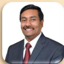
SREE RAGHAVENDRA SRIRAM PTWI India Pvt Ltd