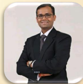
VIMAL LADHA Property Solutions (India) Private Limited